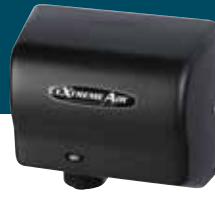
Steel Black Graphite