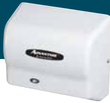
Steel White Epoxy