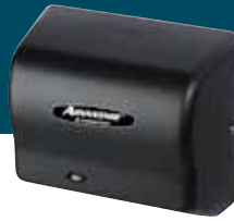
Steel Black Graphite