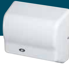
Steel White Epoxy