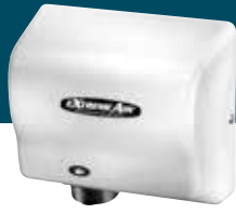
Steel White Epoxy