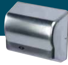
Steel Satin Chrome