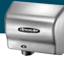
Steel Satin Chrome