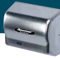
Steel Satin Chrome