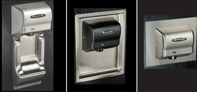
ADA-WG WALL GUARD